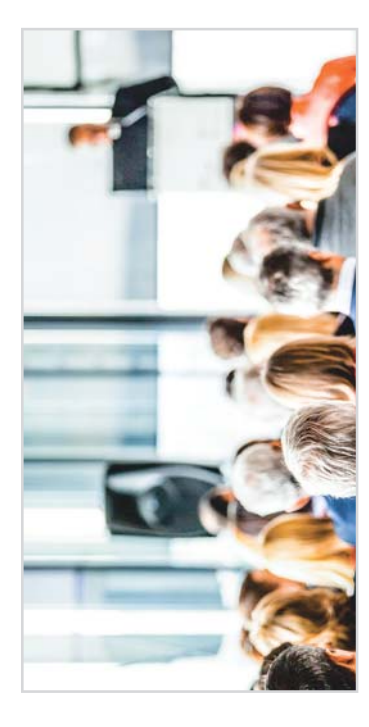
Learn more about our professional and board member development programs on our website at www.sdao.com/sdao-programs-services.

This education program is for board members of all other types of special districts.